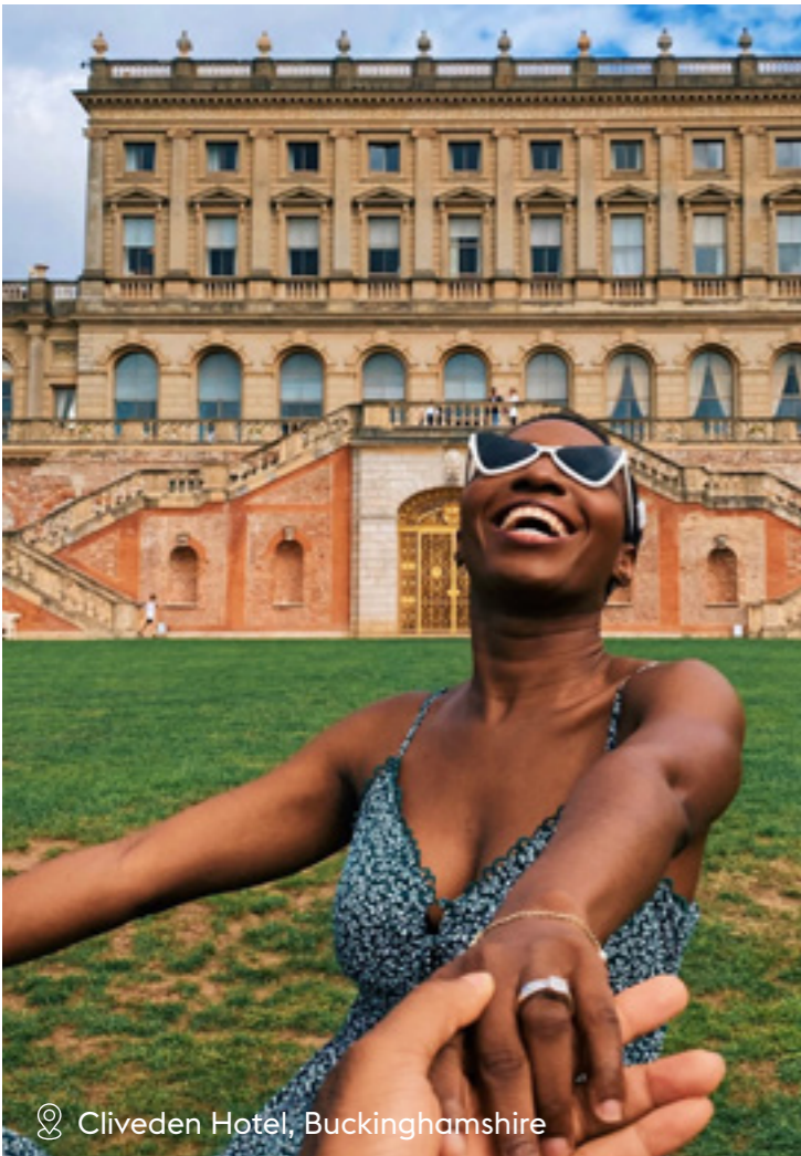
Cliveden Hotel, Buckinghamshire