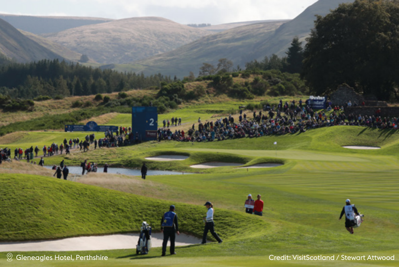
📍 Gleneagles Hotel, Perthshire