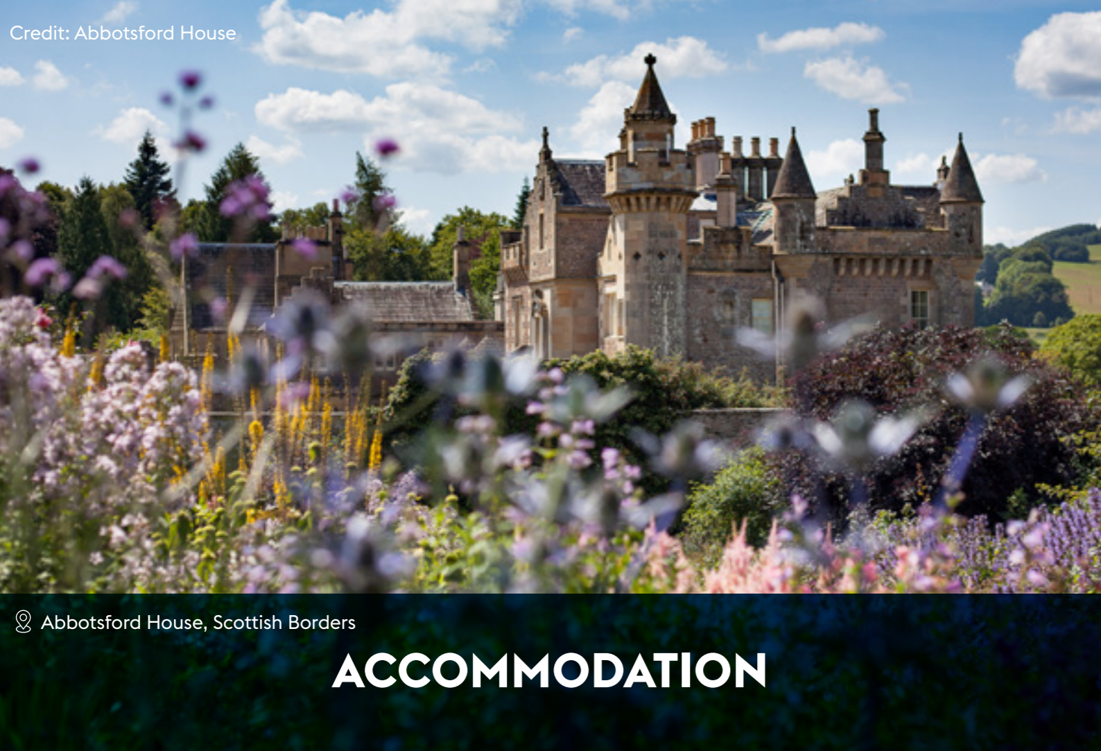
Abbotsford House, Scottish Borders