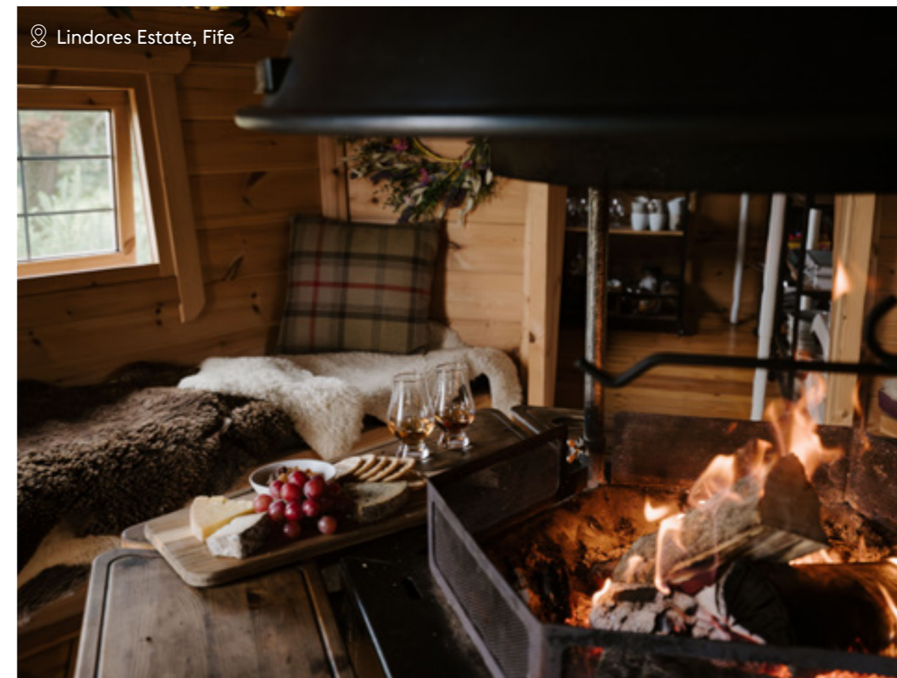
📍 Lindores Estate, Fife