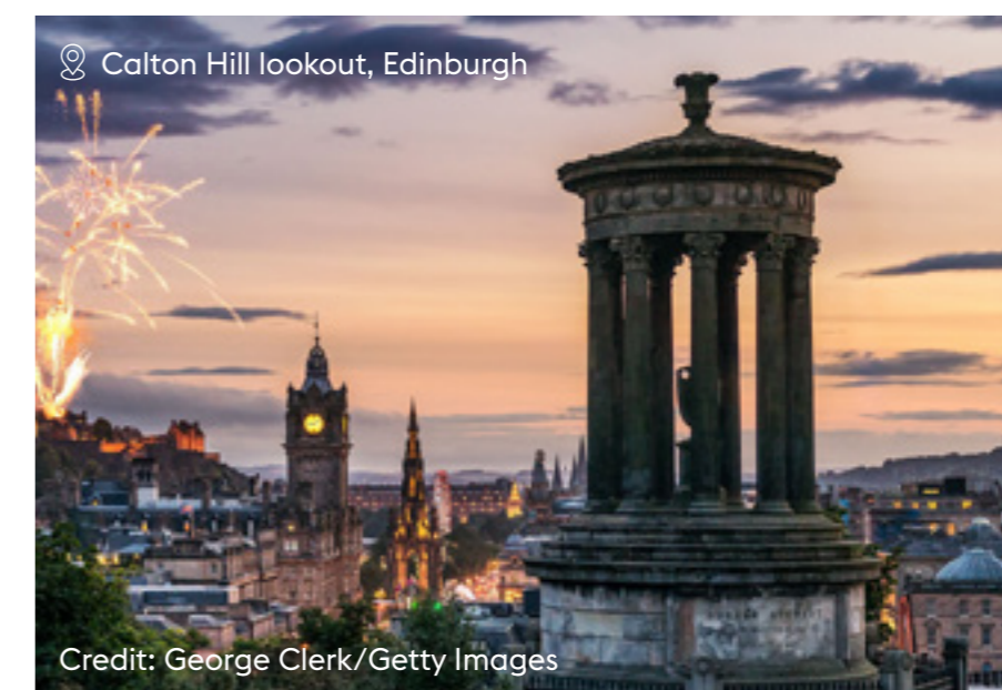
Calton Hill lookout, Edinburgh

Beyond the cities, Scotland's natural landscapes offer loads for those seeking the great outdoors. The Highlands, with their dramatic mountains, lochs and glens, are perfect for bespoke adventures such as private guided hikes and wildlife safaris. Golf enthusiasts can play at world-famous courses like St Andrews, the home of golf, and Gleneagles, while bespoke outdoor adventures await in the Cairngorms where visitors can soar through the breathtaking Rothiemurchus Estate on an exhilarating zip wire adventure.