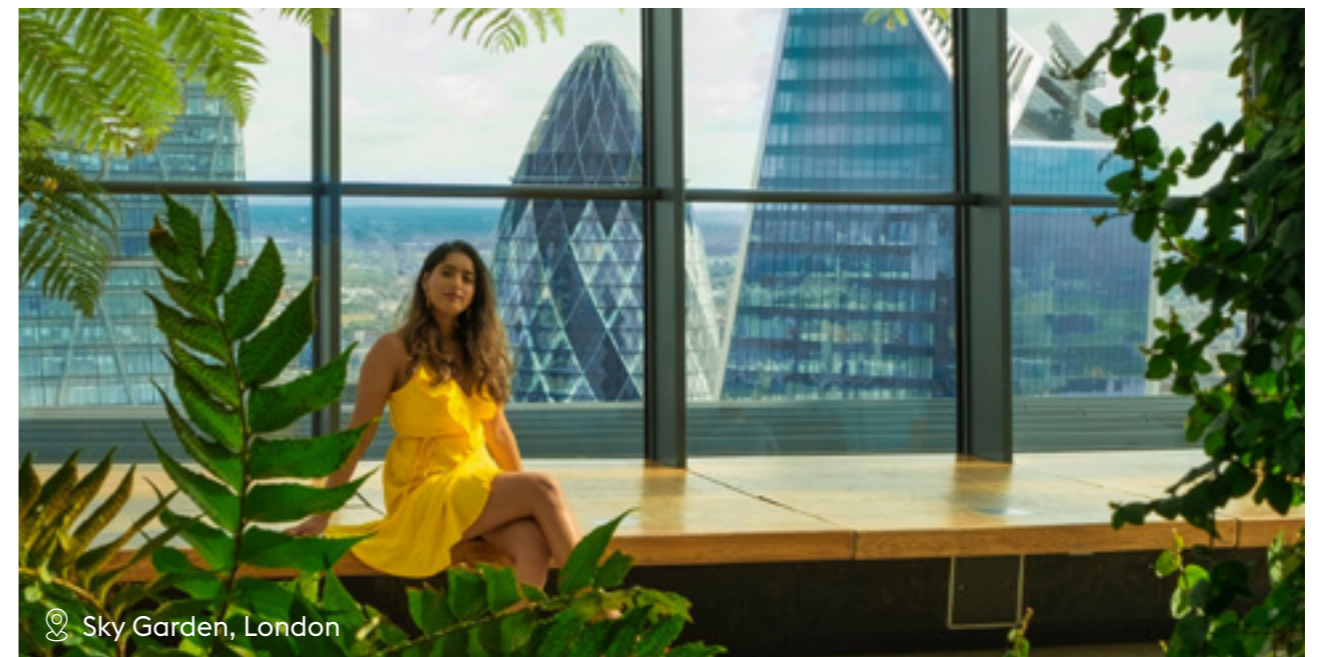
Sky Garden, London