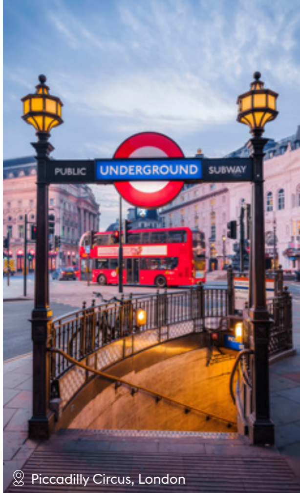
📍 Piccadilly Circus, London