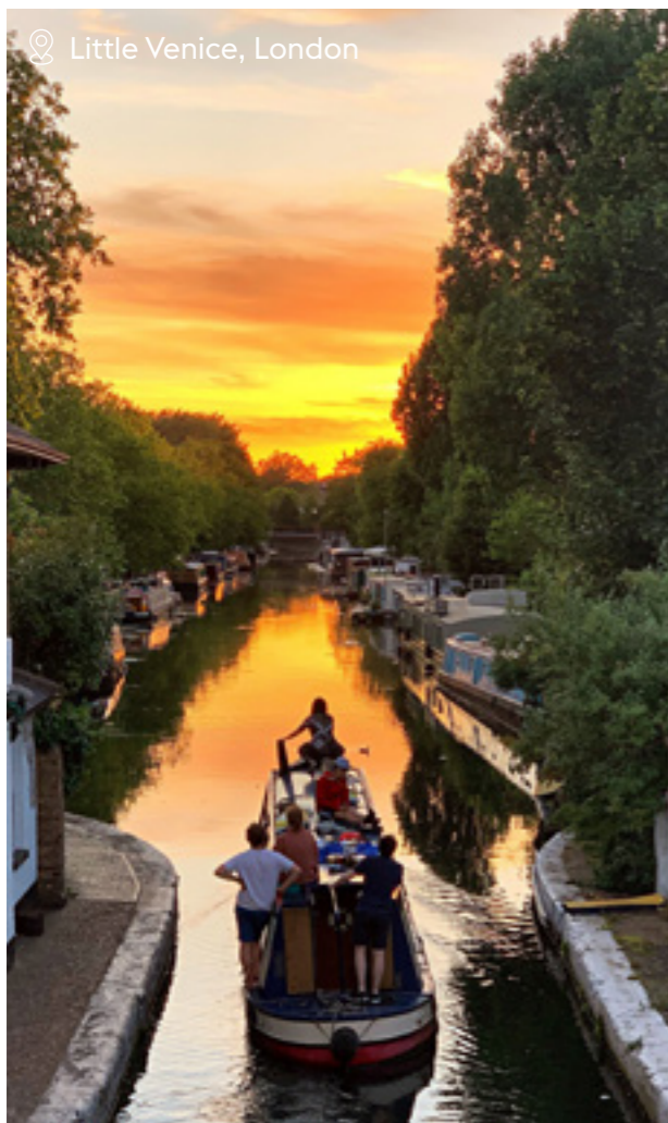
📍 Little Venice, London