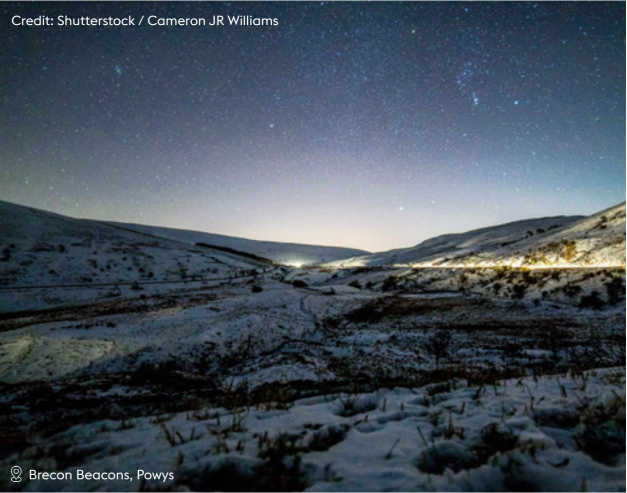
Brecon Beacons, Powys