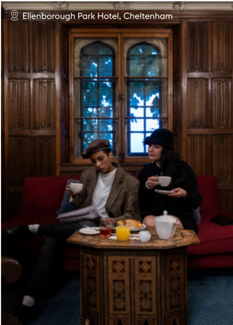
Ellenborough Park Hotel, Cheltenham