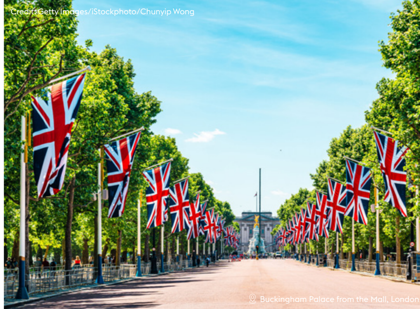
📍 Buckingham Palace from the Mall, London

Dinner by Heston Blumenthal, located in London's Mandarin Oriental Hyde Park, is a 2-Michelin-starred restaurant celebrated for its innovative approach to British cuisine. Created by the renowned chef Heston Blumenthal, and helmed by Chef Adam Tooby-Desmond, the menu reimagines centuries-old British recipes with modern techniques. Highlights include iconic dishes like 'Meat Fruit' (a chicken liver parfait shaped like a mandarin) and 'Topsy Cake', a slow-cooked pineapple dessert. The elegant, contemporary setting includes views of Hyde Park and an open kitchen, providing diners with a theatrical experience. For a more intimate dinner, guests can book a personalised, tailored Dinner Experience (up to 12 guests) in the private dining room, inspired by the 16th century Tudor architectural style. Also available is the Chefs Table experience (up to 6 guests), including a menu of choice served by the kitchen team and a dedicated Chamberlain.