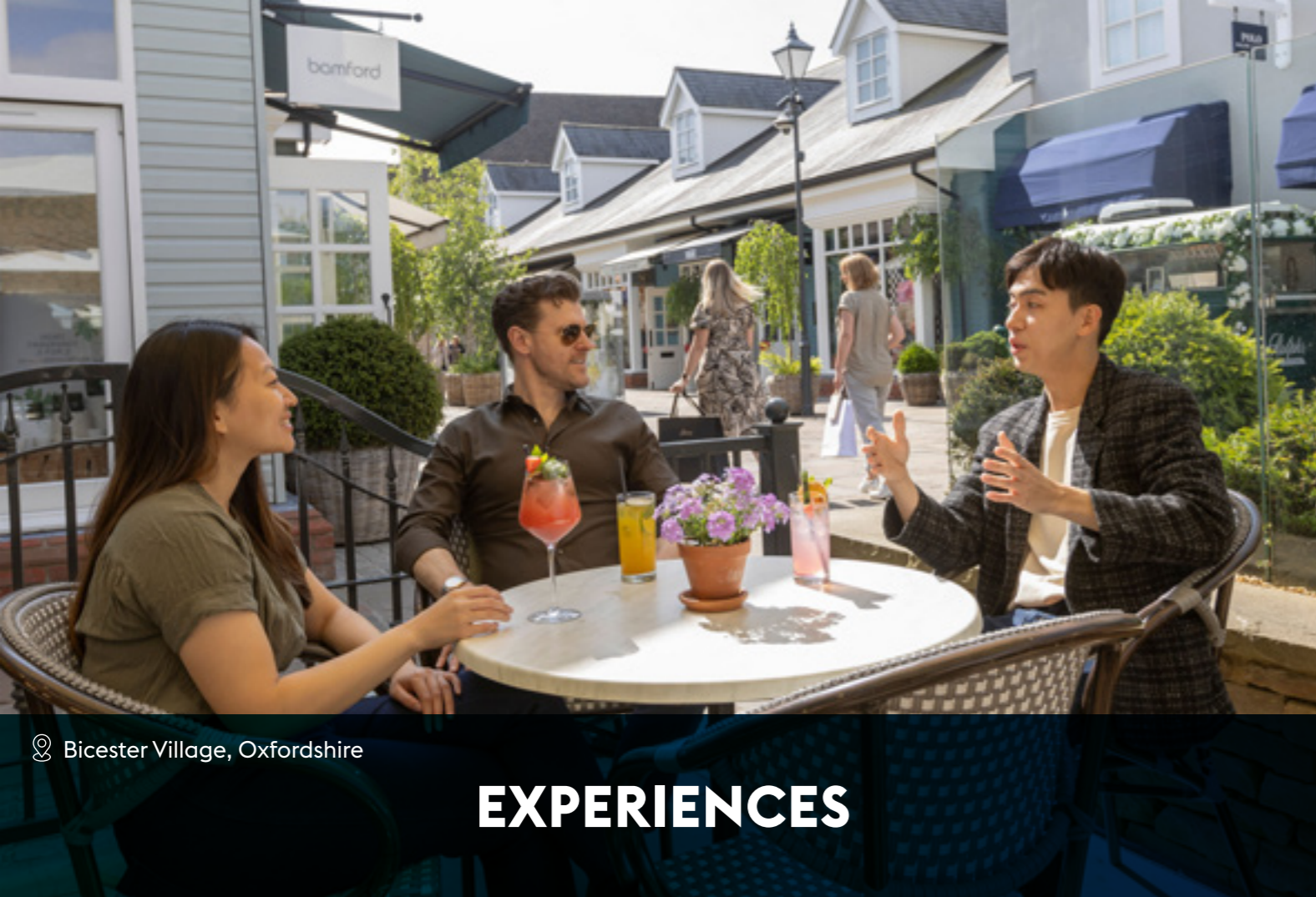
📍 Bicester Village, Oxfordshire