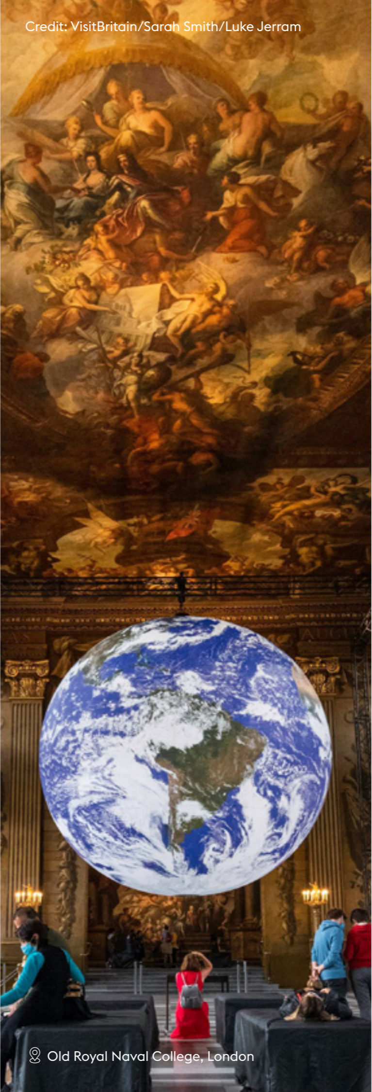
Old Royal Naval College, London