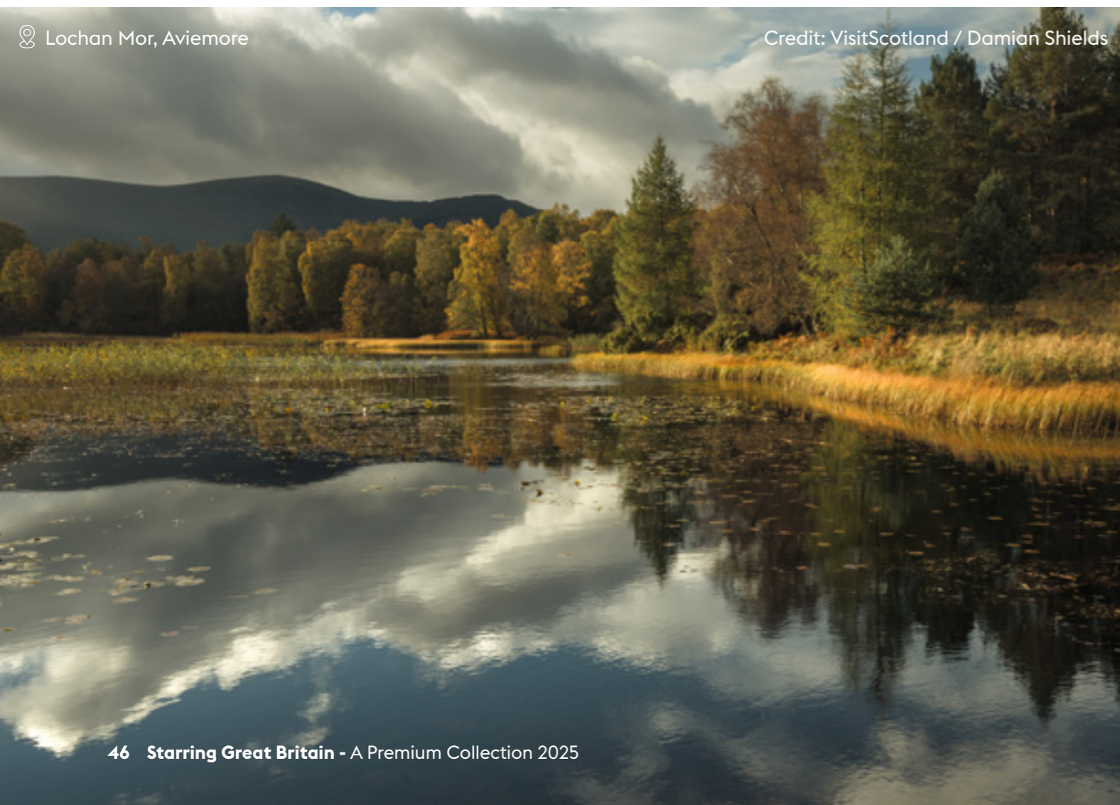
📍 Lochan Mor, Aviemore