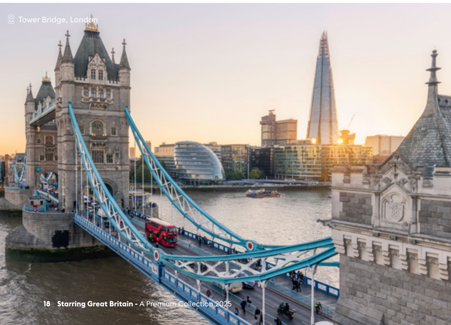
📍 Tower Bridge, London

A London Helicopter Tour offers an exhilarating, bird's-eye view of the capital, soaring above iconic landmarks like Buckingham Palace and the Shard. Taking off just outside the city, the tour sweeps passengers into breathtaking views, revealing London's architectural grandeur. Pilots narrate the journey, adding historical insights and interesting trivia. With varying routes and durations, these tours cater to adventurers and sightseers alike. Perfect for special occasions or unique perspectives.