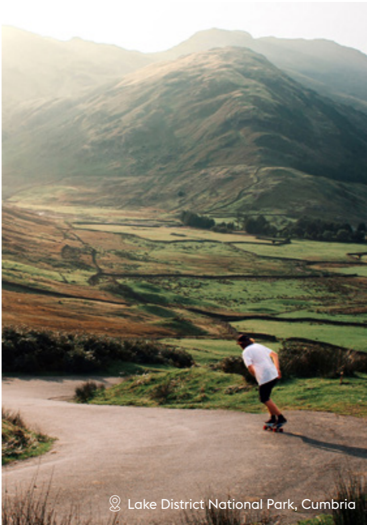
Lake District National Park, Cumbria