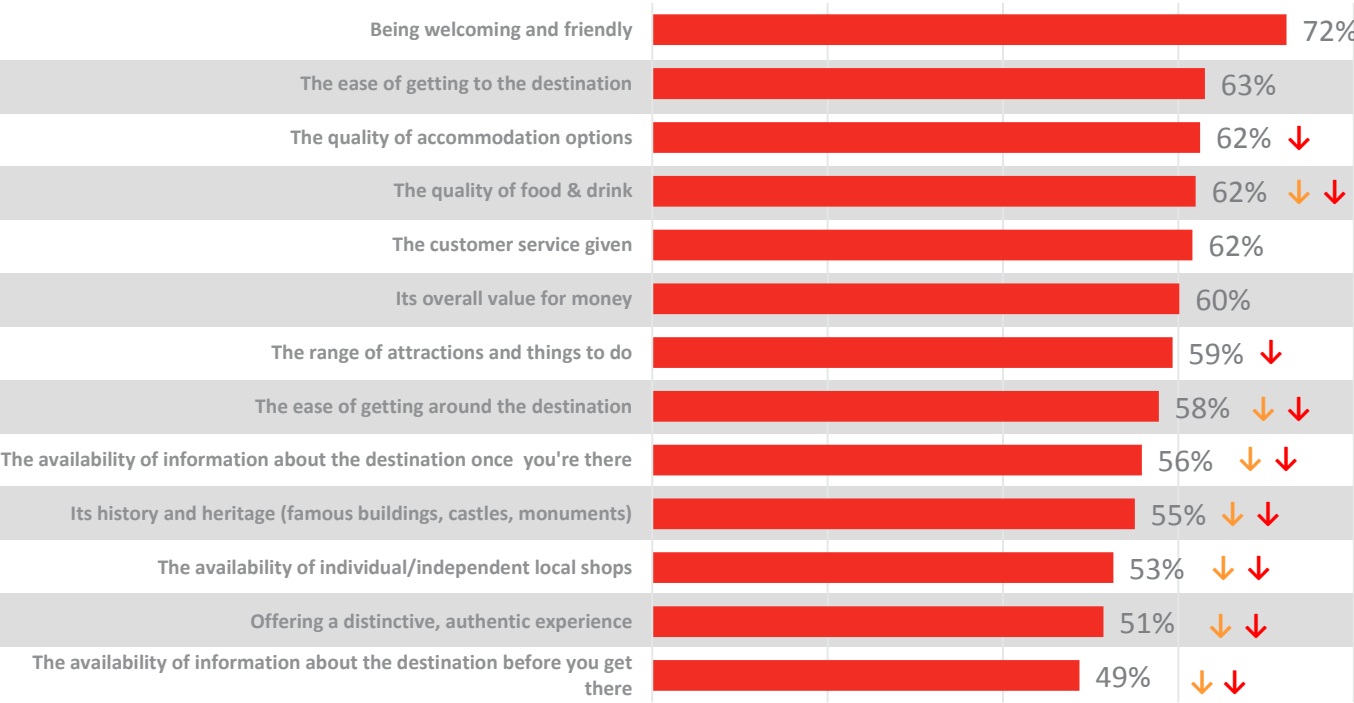
Destination attributes difference analysis