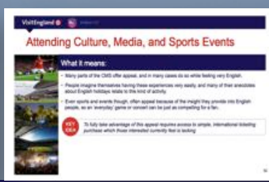
STRENGTHS & CHALLENGES