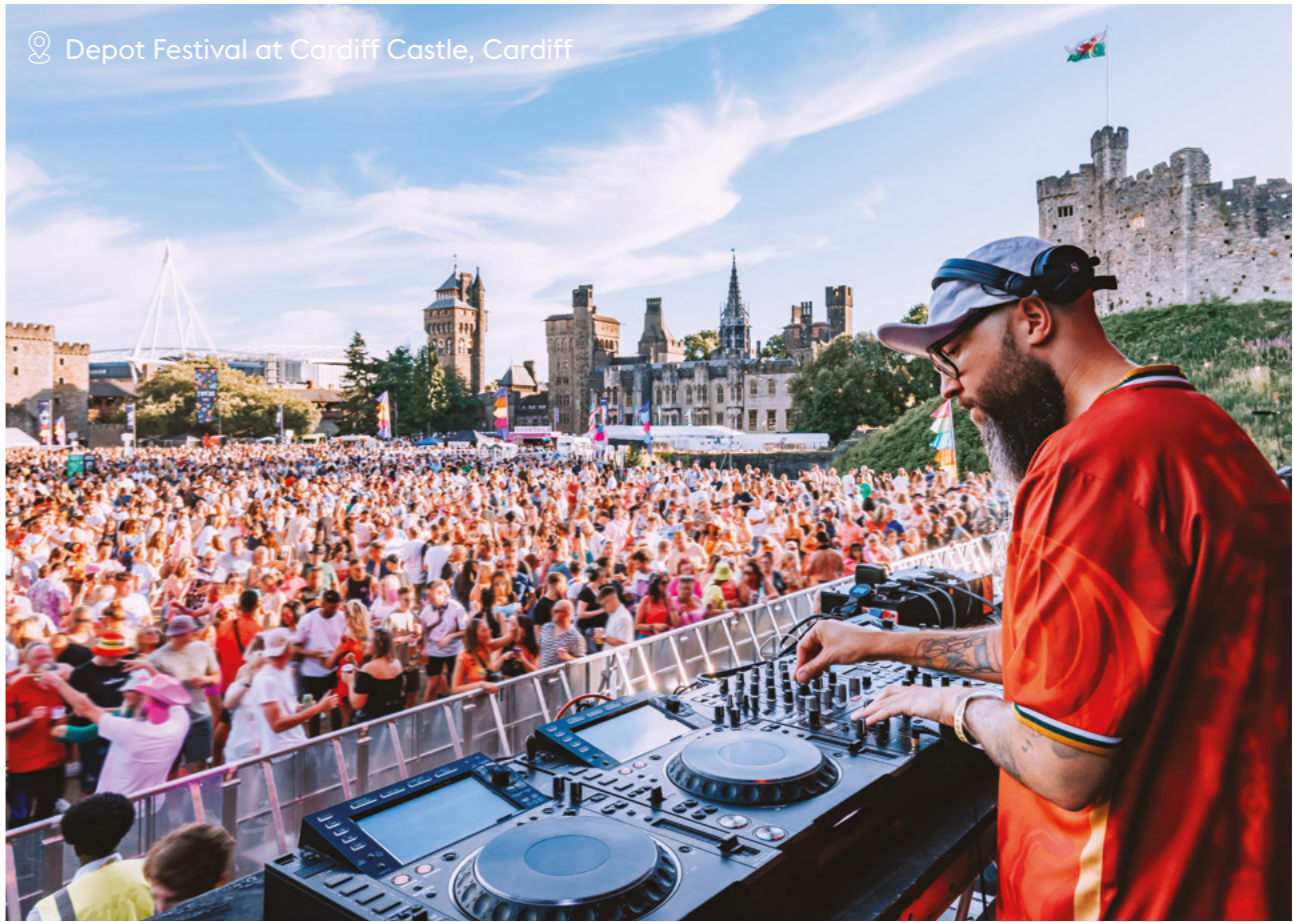
Depot Festival at Cardiff Castle, Cardiff