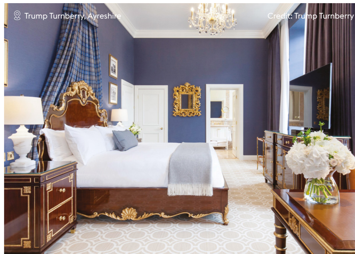
📍 Trump Turnberry, Ayrshire