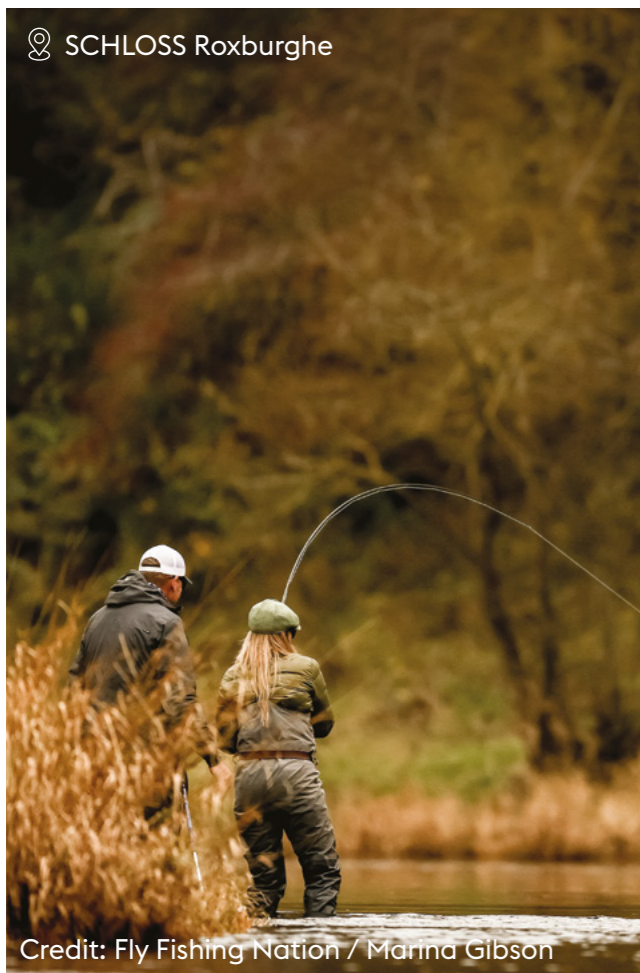
📍 SCHLOSS Roxburghe