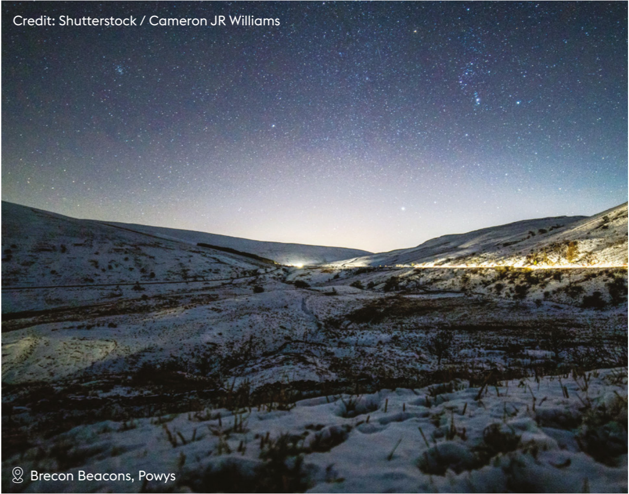
Brecon Beacons, Powys