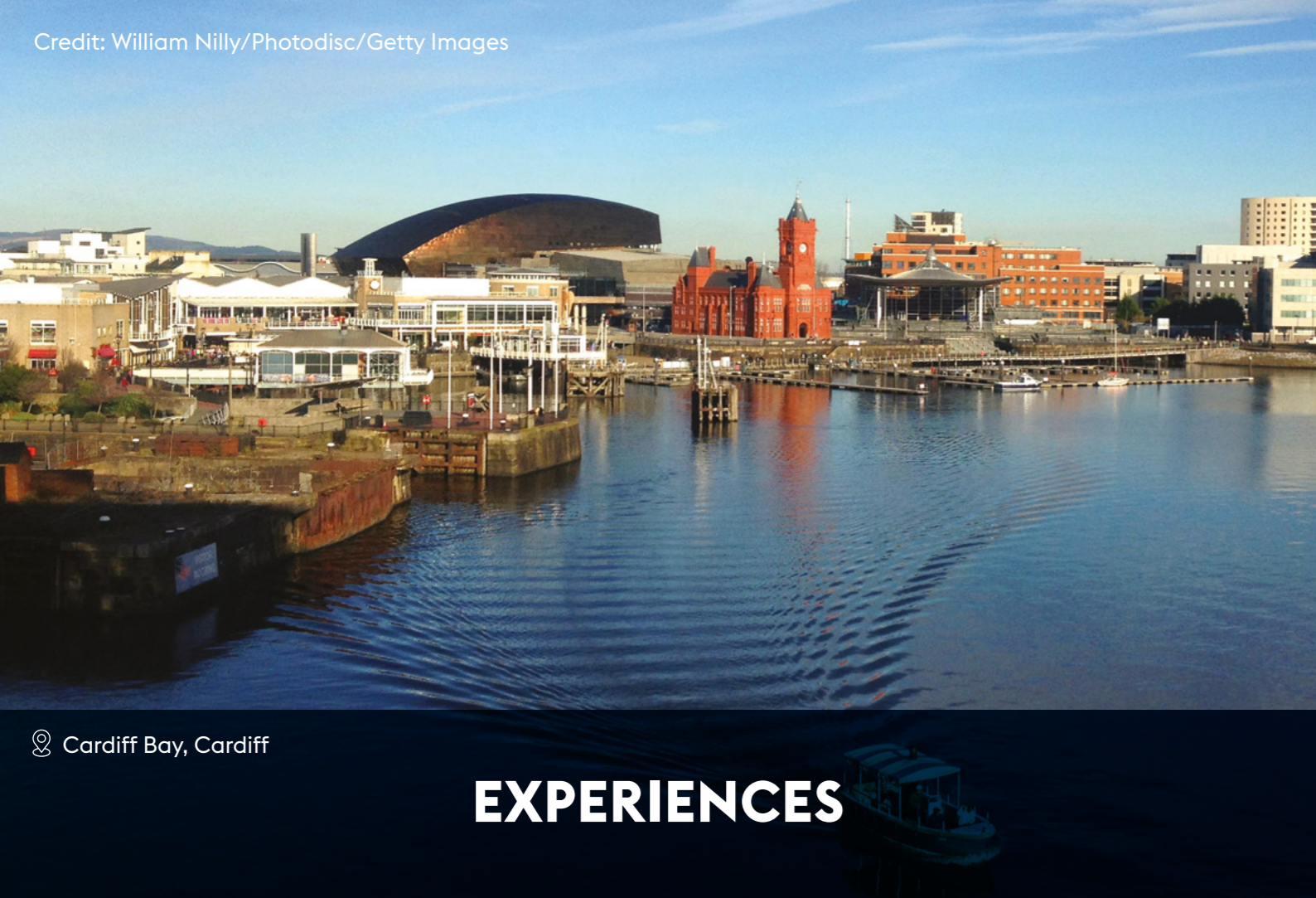
Cardiff Bay, Cardiff