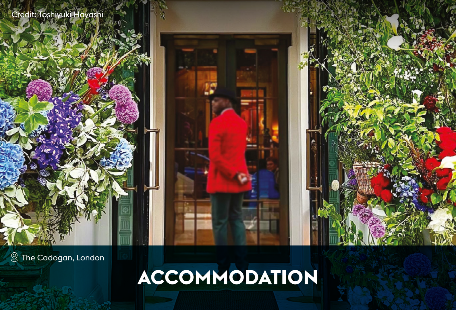
The Cadogan, London