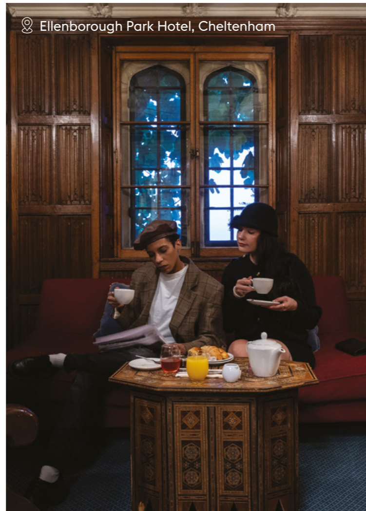
Ellenborough Park Hotel, Cheltenham