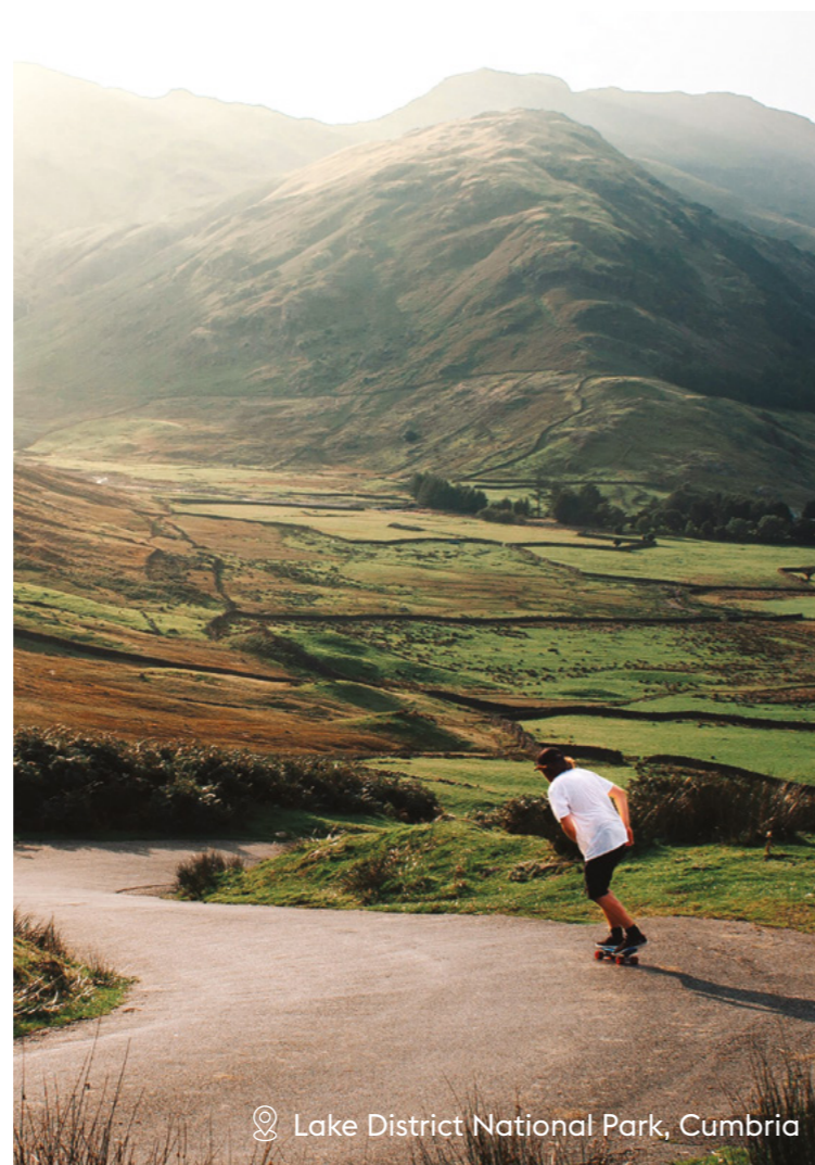
Lake District National Park, Cumbria