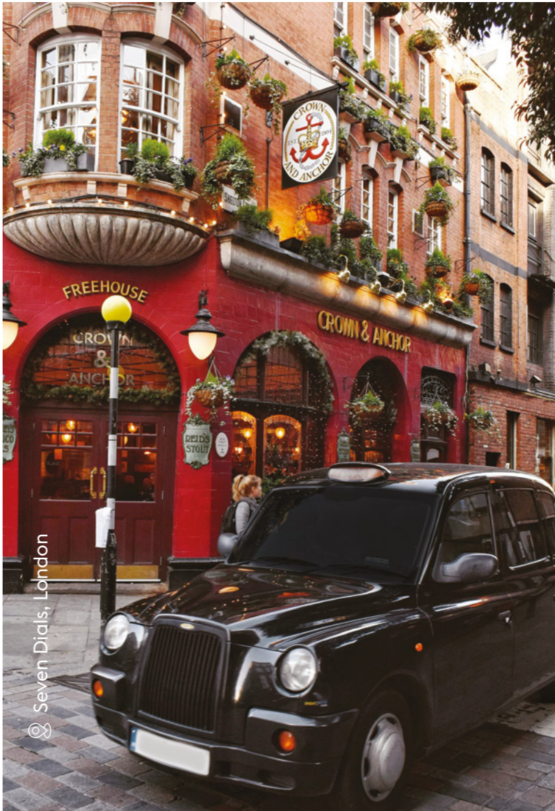
Seven Dials, London