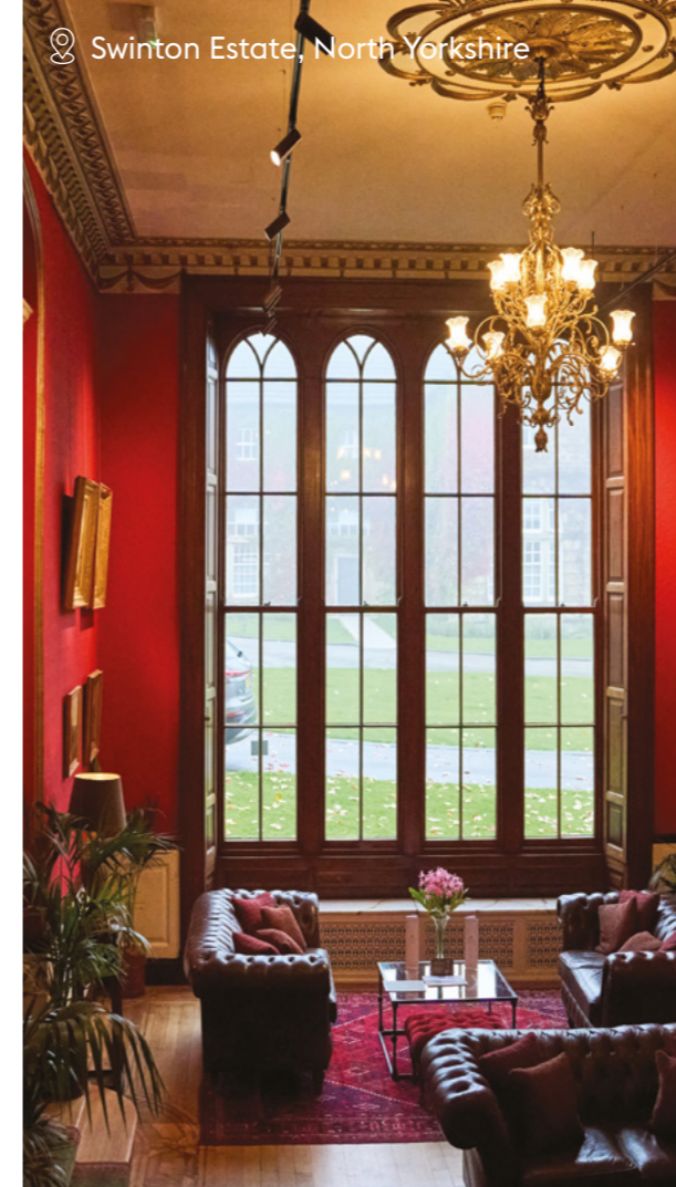
Swinton Estate, North Yorkshire