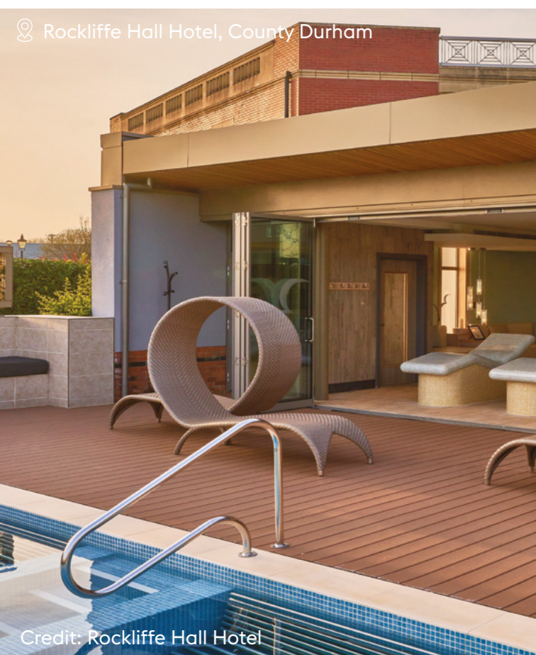
Rockliffe Hall Hotel, County Durham