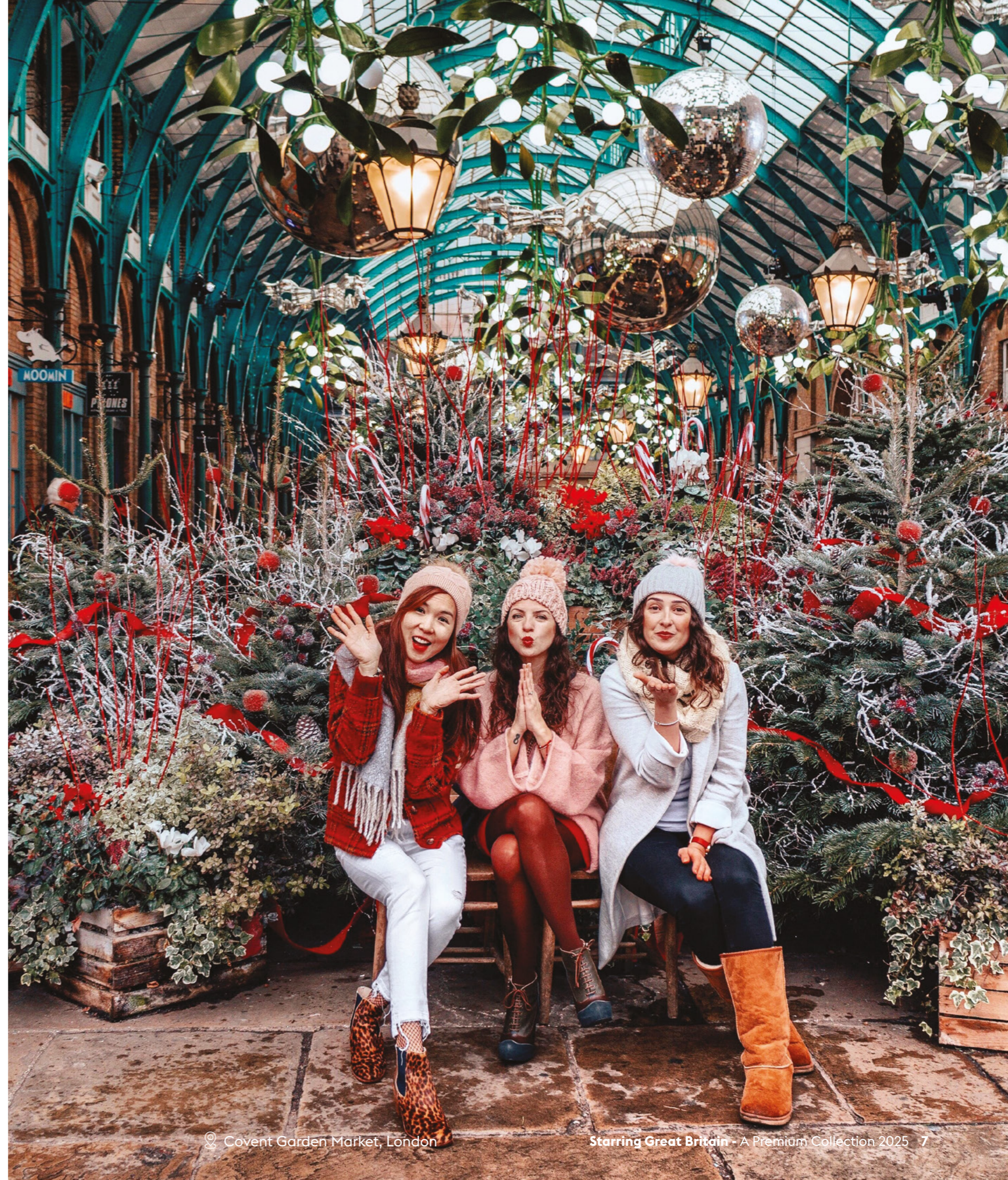
Covent Garden Market, London

In this guide, we have curated the finest and most prestigious experiences that Britain has to offer, ensuring that even your most discerning clients will be satisfied. It's time to make Great Britain the star of your show!