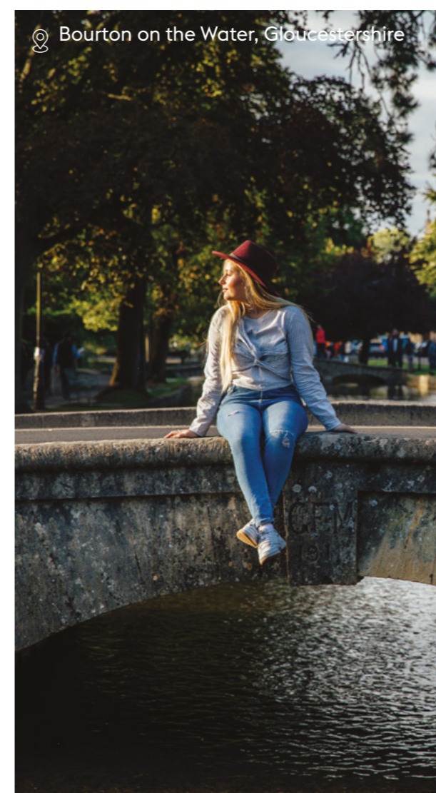
Bourton on the Water, Gloucestershire