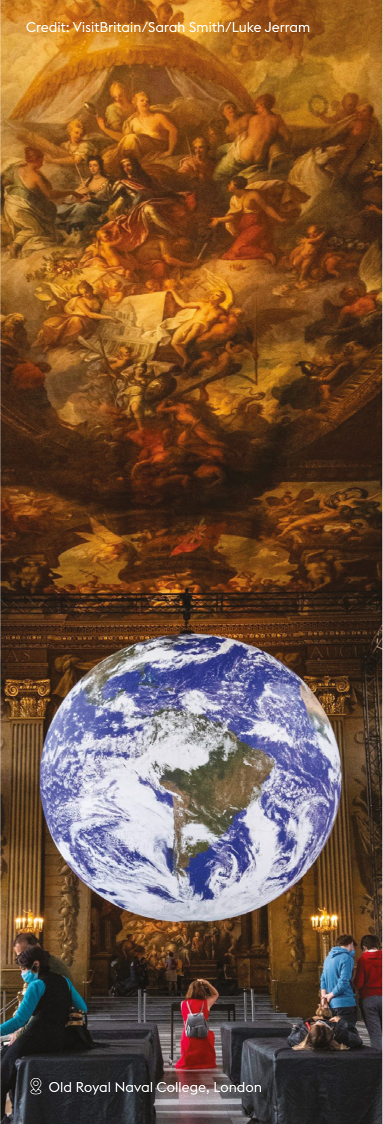
Old Royal Naval College, London