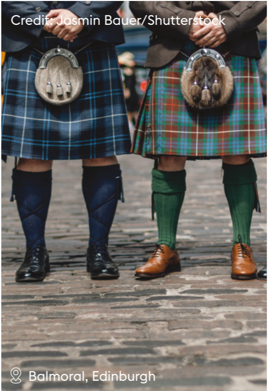
📍 Balmoral, Edinburgh