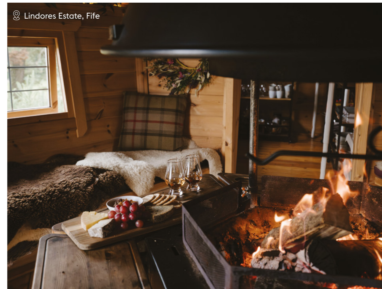
Lindores Estate, Fife