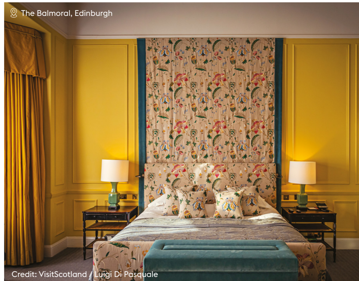
📍 The Balmoral, Edinburgh