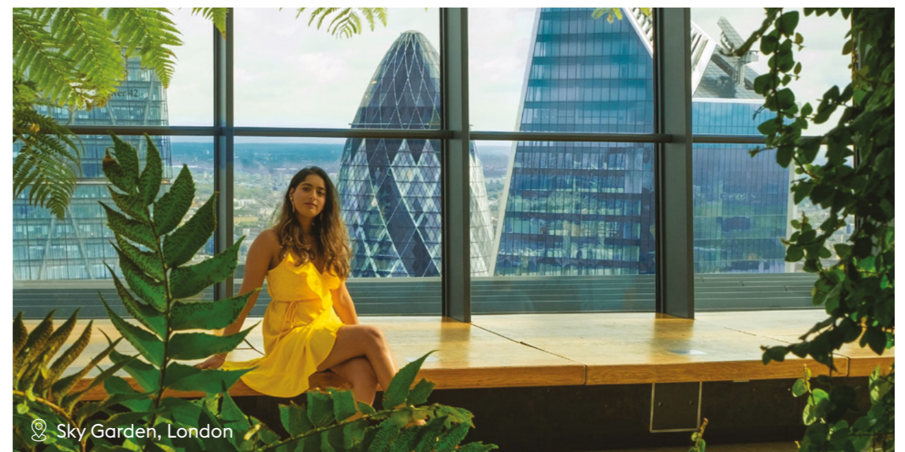
📍 Sky Garden, London